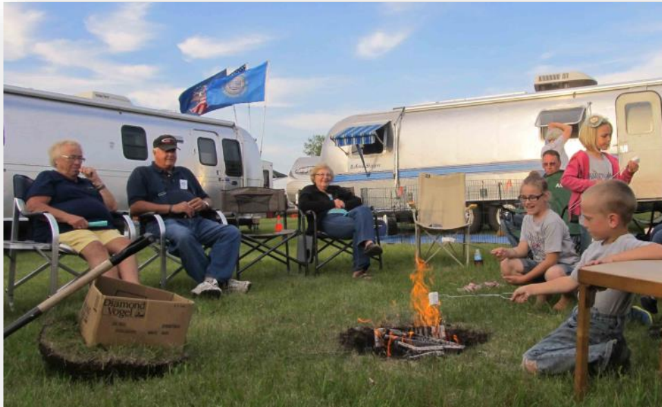
Relaxing around the campfire with good friends and gooey treats